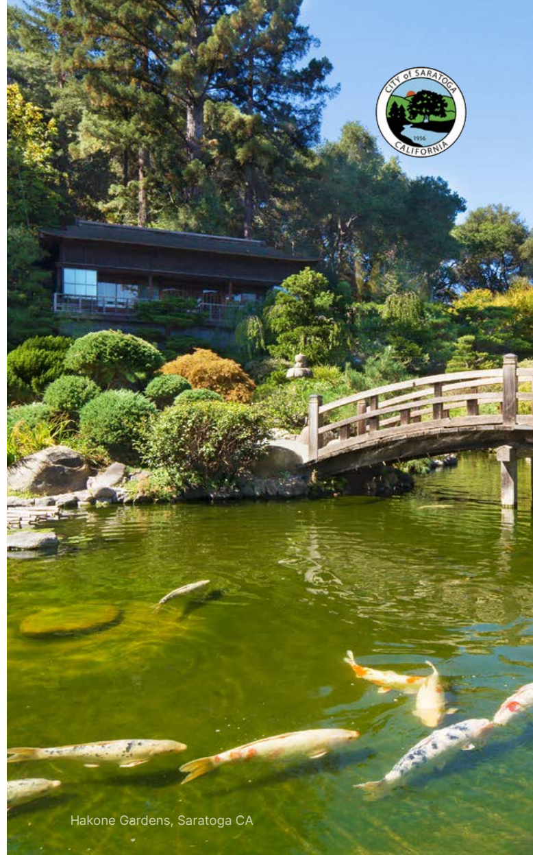
Hakone Gardens, Saratoga CA